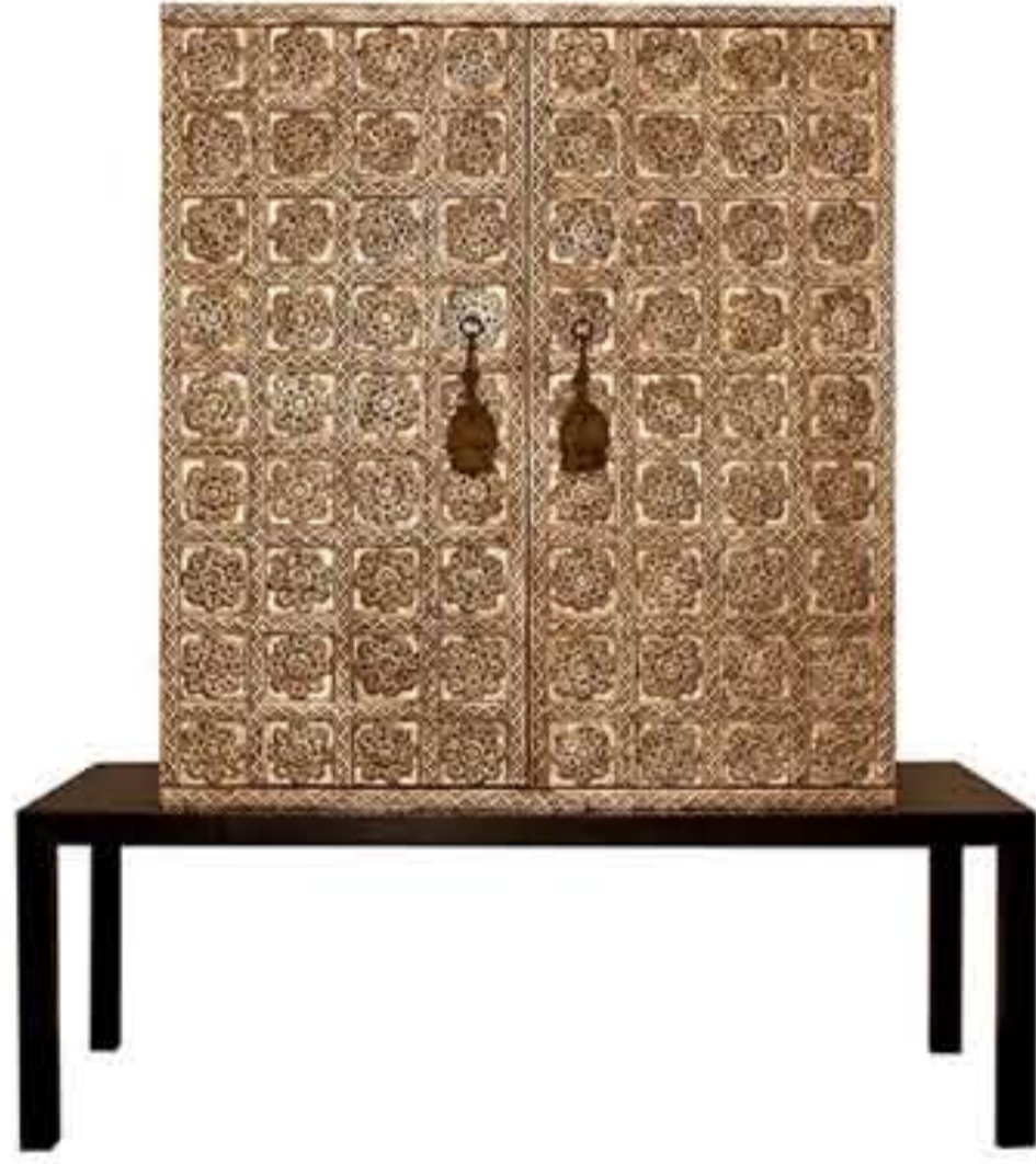
Barbara Abaterusso Design - Varnished Wood Furniture