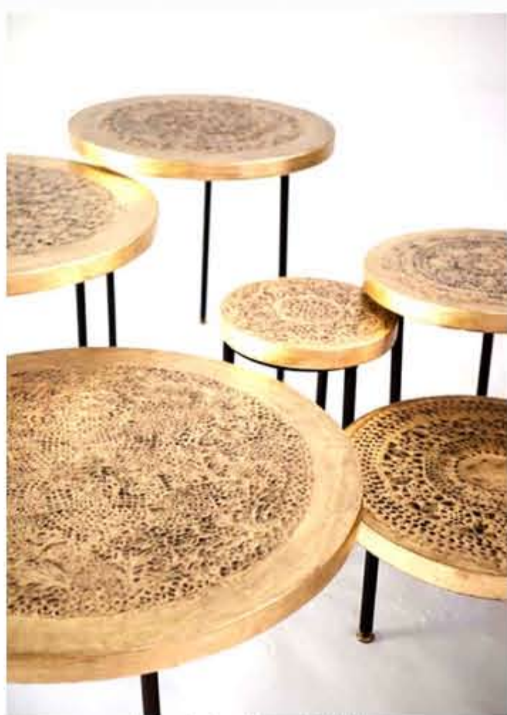
Barbara Abaterusso Design - Small Tables